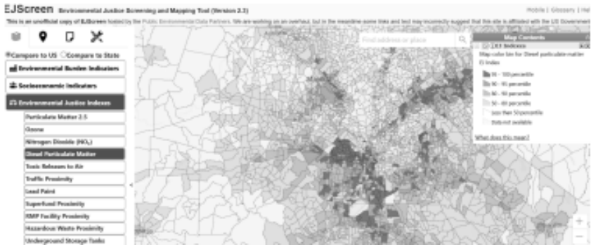
Figure 2: Concentration of Diesel PM (Environmental Justice Screening and Mapping Tool, Version 2.3)