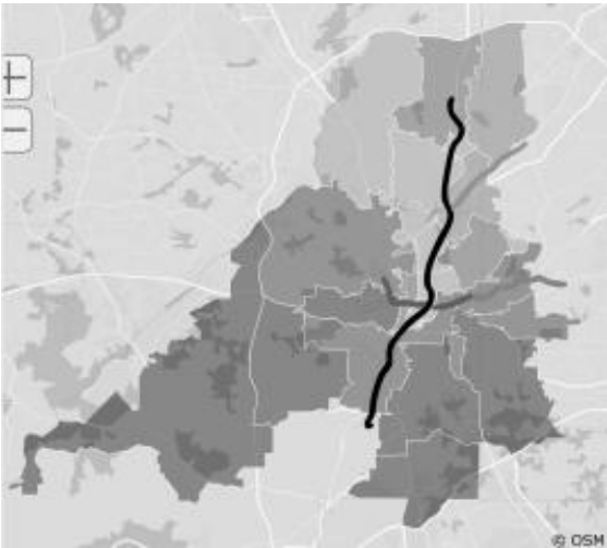
Figure 4: Atlanta’s Median Commute Times (Spectrum)

representing the bottom 20%. Each map is overlaid with the current MARTA routes; the black route is a rail route, while all other colors are bus routes.