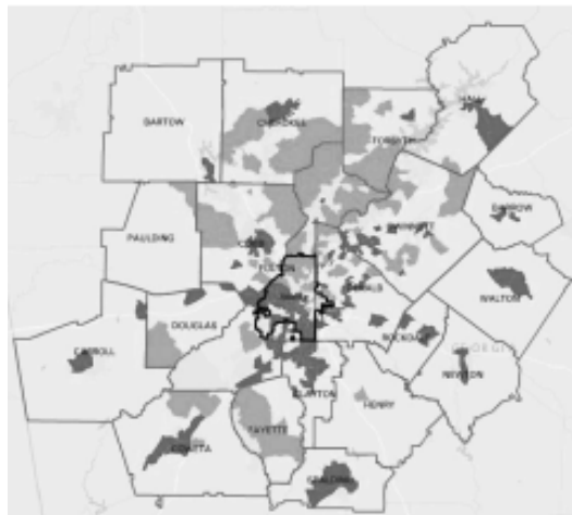
Figure 3: Highest & Lowest Median Household Incomes (Kelly, 2016)