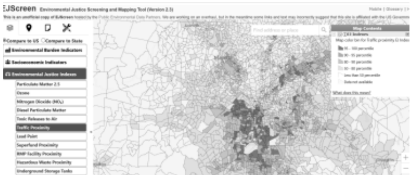
Figure 1: Traffic Proximity in Atlanta

These health issues disproportionately impact low income residents, as demonstrated by Figures 1, 2, and 3 below. Figure 1 shows a map of traffic proximity in Atlanta, Figure 2 shows the concentration of diesel PM, and Figure 3 shows a map of the highest and lowest median household incomes in the city. The lighter areas represent the top 20% of earners, and the darker areas represent the bottom 20%. These maps clearly illustrate an overlap in the highest concentration of diesel PM and lowest income residents. Not only does this overlap mean low income households are at higher risk of health issues, but they are also responsible for paying for those issues, creating a large economic burden for those families.